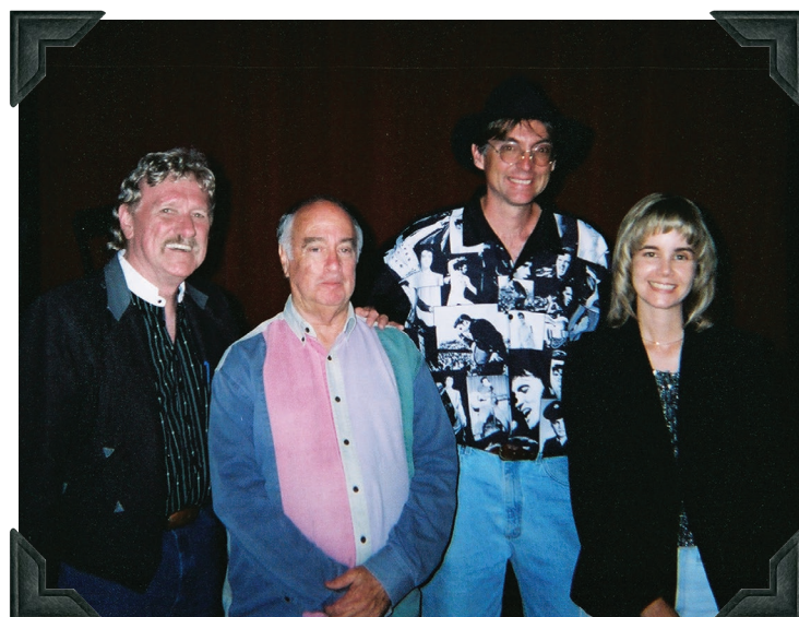
← before the show