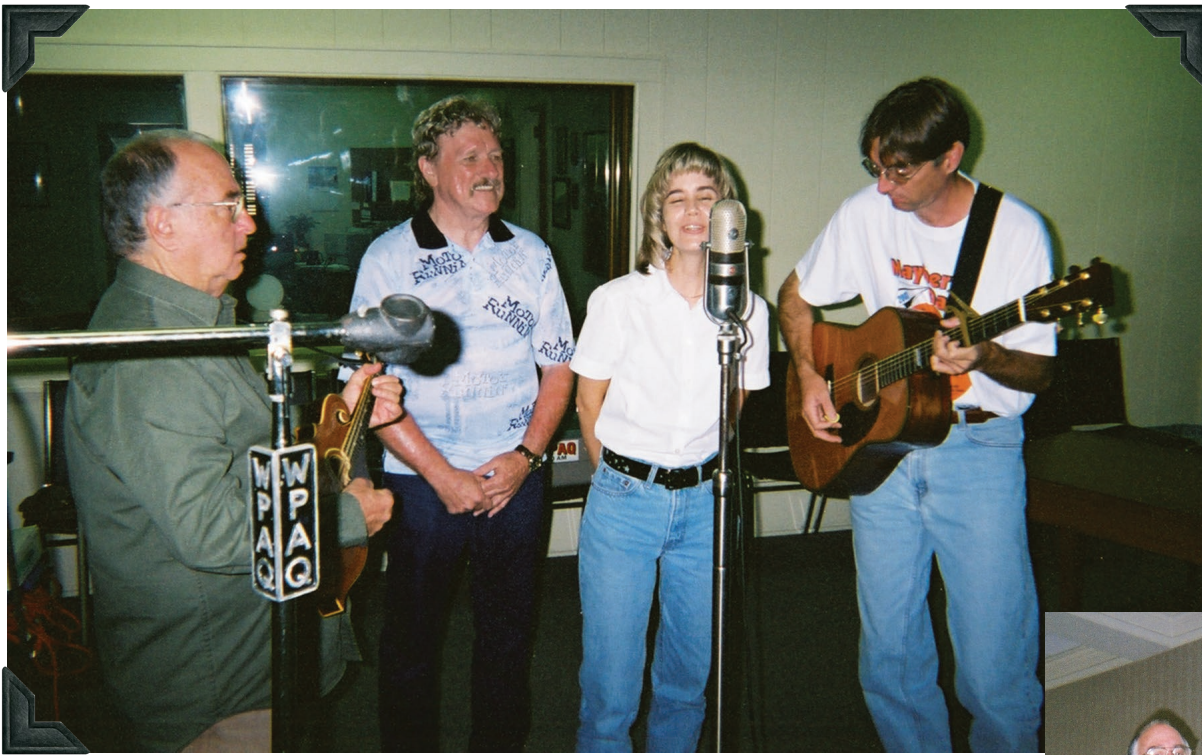
← VERY early morning radio show!